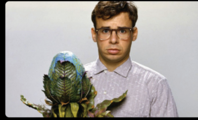
Little Shop of Horrors PG

FROM FRI 26 APR 2023, 90MINS, BELGIUM/DRC + OTHERS