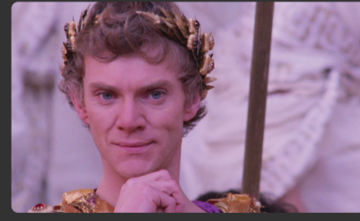
Caligula: The Ultimate Cut Preview with live intro CERT TBC

FROM FRI 10 MAY 2024, 95MINS, MALAYSIA/FRANCE