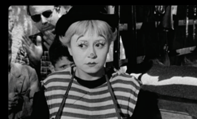
La Strada PG

In its 70th year, Fellini's Italian masterpiece returns, featuring a captivating Giulietta Masina. Showing in partnership with Welcome2Italian and Amacort Film Festival.