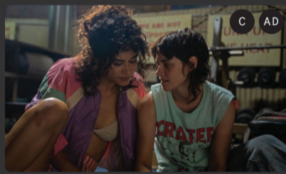
Love Lies Bleeding 15

From filmmaker Rose Glass ( Saint Maud ) comes an electric new love story. Reclusive gym manager Lou (Kristen Stewart) falls hard for Jackie, an ambitious bodybuilder. But their love ignites violence, pulling them into the web of Lou's criminal family.