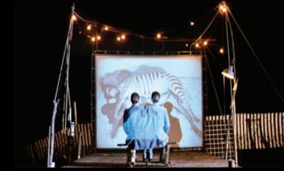
A Zed and Two Noughts 15

Following a fatal car crash involving a swan outside a zoo, twin-brother zoologists Oliver and Oswald become fascinated by the processes of decay in this visceral and cerebral treat