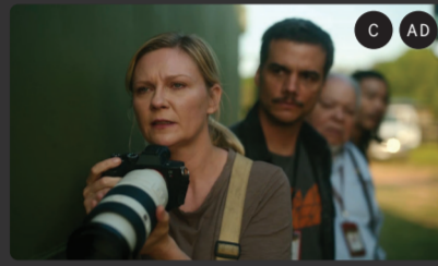
Civil War CERT TBC

From visionary filmmaker Alex Garland ( Ex Machina ) comes an adrenaline-fueled thrill ride through a near-future fractured America balanced on the razor's edge – starring Kirsten Dunst and Nick Offerman.