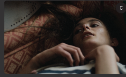
Hoard CERT TBC

SAT 11 MAY • 18:00 (TBC) 1976, 178MINS, USA