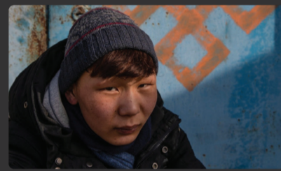
If Only I Could Hibernate CERT TBC

FROM FRI 03 MAY 2024, 104MINS, UK/IRELAND