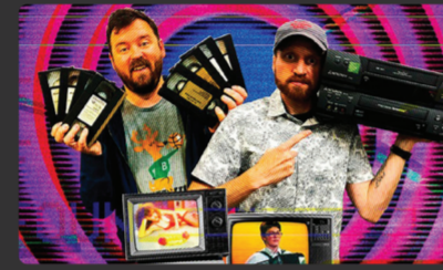
Found Footage Festival Volume 10 18

FROM FRI 19 APR 2023, 169MINS, SPAIN/ARGENTINA