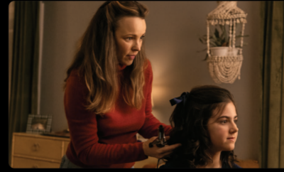
Are You There God? It's Me, Margaret PG

SAT 06 APR • 11:00 1986, 101MINS, UK/USA