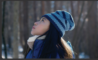
Evil Does Not Exist 12A

In a small, idyllic Japanese village lives a tight-knit community, whose peace is threatened when a new tourist spot is planned nearby, in this fascinating and unpredictable eco-drama from Oscar-nominated writer-director Ryusuke Hamaguchi ( Drive My Car ).