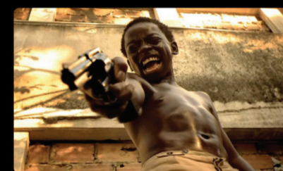
City of God 18

Now a cult classic with a powerful legacy, Fernando Meirelles and Kátia Lund's Brazilian crime epic returns to the big screen – playing in association with West Yorkshire Cameras.