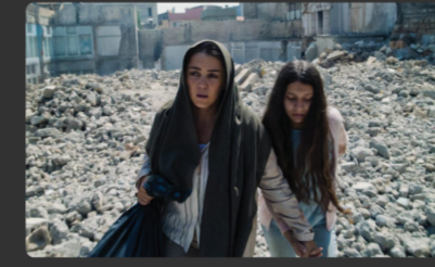
Nezouh CERT TBC

An unexpectedly poetic and tender film of a tyrannical father who decides, for his wife and daughter, to remain in their home in Damascus, despite the ruin and danger of the besieged city surrounding them.