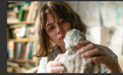
Showing Up 12A

FROM FRI 05 APR 2023, 102MINS, THE NETHERLANDS/UK