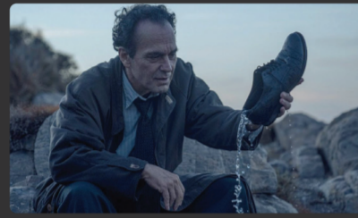
Close Your Eyes 12A

It's been 30 years since the Spanish master's last film and Victor Erice ( The Spirit of the Beehive ) doesn't disappoint with a mystery of a missing actor, in an engrossing and gentle tale of aging, memory and cinema. "A triumphant return" – Sight and Sound .