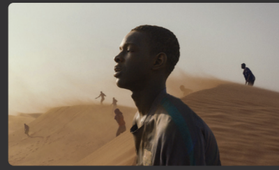
Io Capitano 15

FROM FRI 05 APR 2023, 102MINS, SPAIN/FRANCE