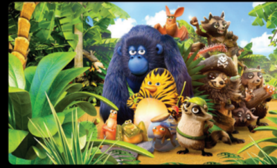
The Jungle Bunch: World Tour U

SAT 13 & SUN 14 APR • 11:00 1986, 94MINS, USA