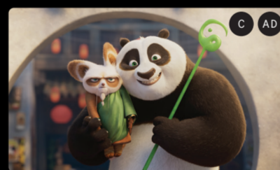
Kung Fu Panda 4 PG

SAT 27 & SUN 28 APR • 11:00 2021, 95MINS, USA/ITALY/JAPAN