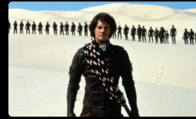
David Lynch's Dune 12A

SAT 20 & SUN 21 APR • 11:00 2023, 99MINS, FRANCE