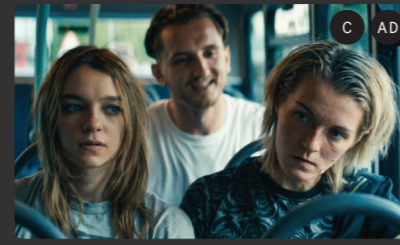
Silver Haze 15

FROM FRI 05 APR 2024, 122MINS, ITALY/BELGIUM