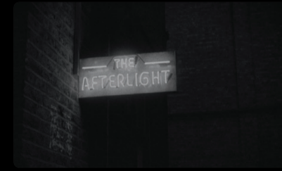
The Afterlight PG

With intro from Charlie Shackleton Fragments of hundreds of films from around the world bring together an ensemble cast in this unique work that exists as a single 35mm print.