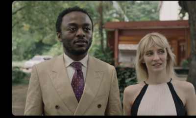
Omen CERT TBC

SUN 14 APR • 14:00 1985, 112MINS, UK/NETHERLANDS